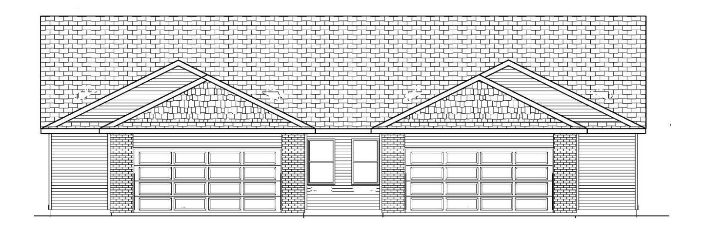
Attached Unit 1,420 Sq. Ft. $184,900